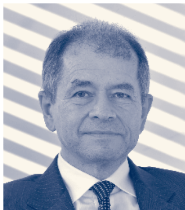
President, All European Academies (ALLEA)