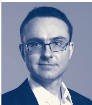
SAM High Level Group