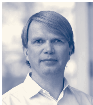
Head of Research, Foresight Centre, Parliament of Estonia