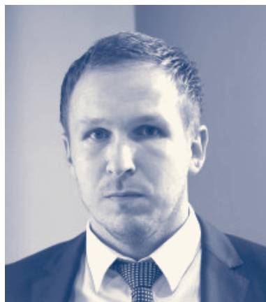
Strategy Director, Government Office of Estonia