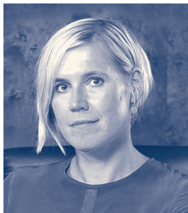
Chancellor of Justice