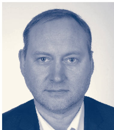
Director, Economic Development Department, Ministry of Economic Affairs and Communications