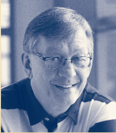
Institute of Biotechnology, HiLIFE, University of Helsinki