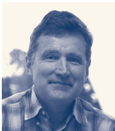
University of Tartu