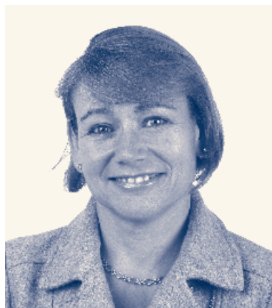
Head, UK and Europe Research Landscape, Wellcome Trust