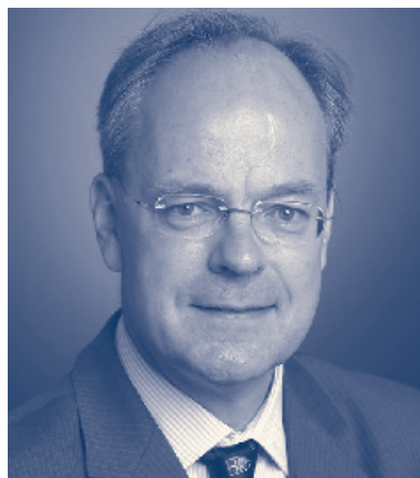
German Ambassador to Estonia